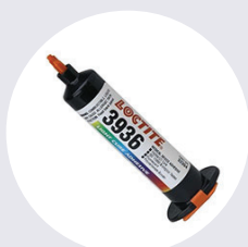
Medical adhesives, tapes & films

Through supplier-partnerships with key industry manufacturers, Hisco is equipped to offer medical manufacturing solutions to address any assembly challenge.