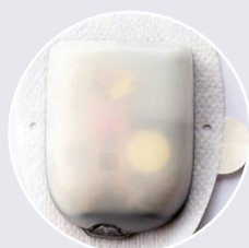
Custom converted adhesives and flexible materials