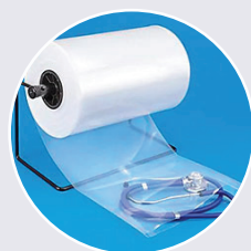
Medical cleanroom use packaging