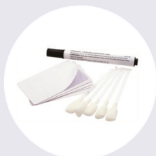
Cleanroom chemicals, swabs and wipes