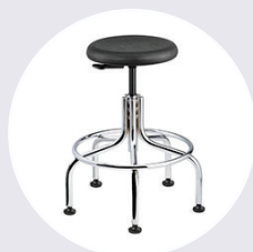
Cleanroom seating, workstations & bench top supplies